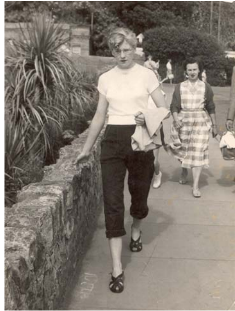
Which member of the Library staff's mum is this in 1955?