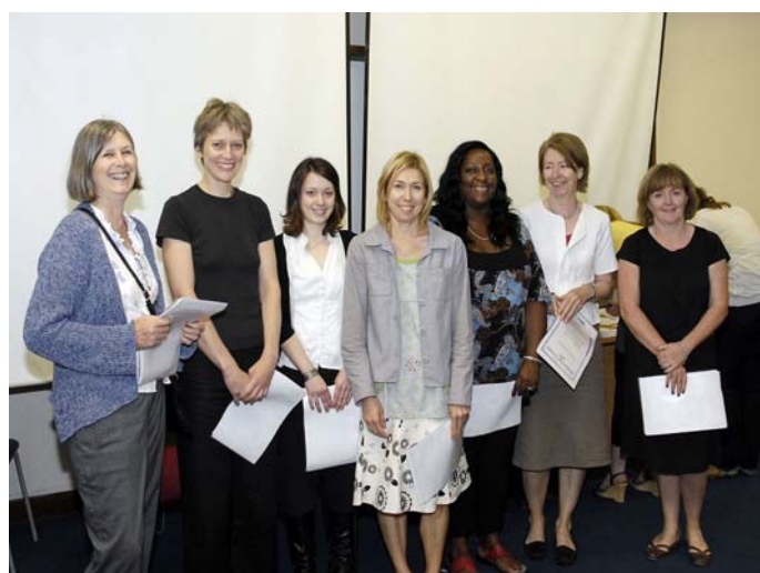
School librarians receiving certificates for their students